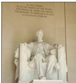
The Lincoln Memorial.